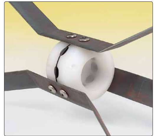
• Model 1900-7A Spider Magnet (double-ended) for 1" pipe.