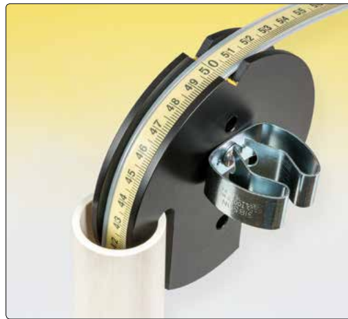
• Model 1900-11, Index Mark closeup.