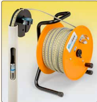
● Model 1900-11, shown with Index Mark and Reed-Switch Probe in 1" pipe.