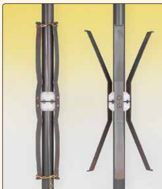
● Model 1900 Anchor, shown before and after release.