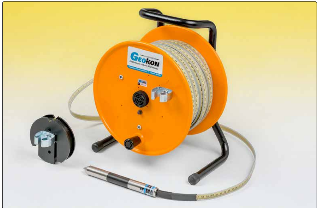
● Model 1900-11 Reed-Switch Probe and Index Marker.