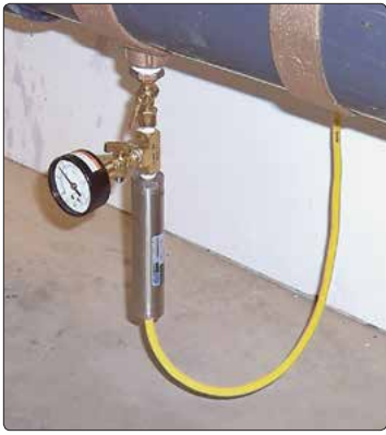
• Model 3400H and Dial Gage Pressure Transducer on a tee fitting.