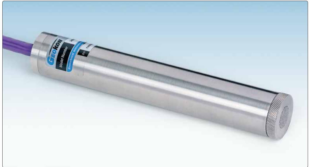
• Model 3400S-1/2 Semiconductor Piezometer.