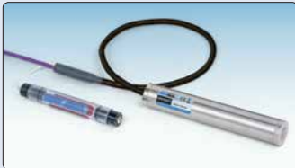
• Model 3400SV-1/2 Semiconductor Vented Piezometer.