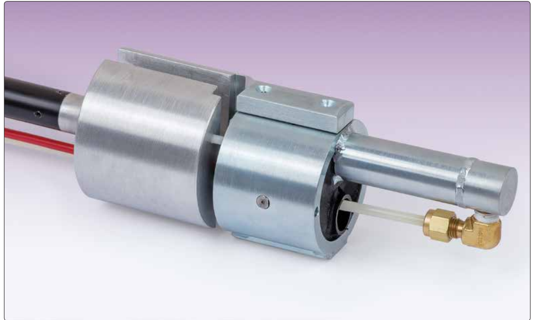
• Model 4360-1-1 Soft Inclusion Stress Cell (hydraulically actuated), in setting tool assembly.