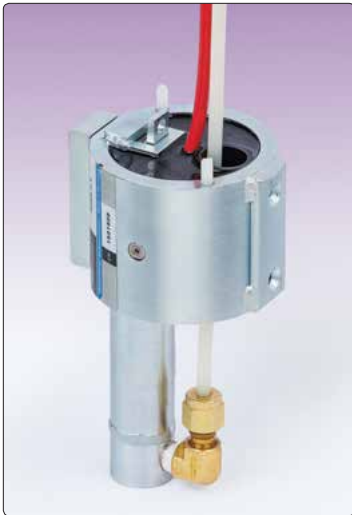
● Model 4360-1-1 Soft Inclusion Stress Cell (hydraulically actuated).