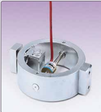
• Model 4360-2-2 Soft Inclusion Stress Cell (mechanically actuated).