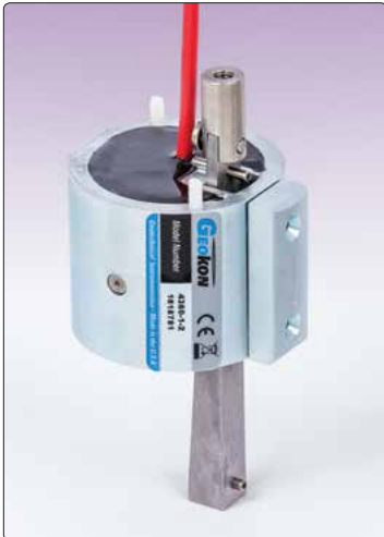
● Model 4360-1-2 Soft Inclusion Stress Cell (mechanically actuated).