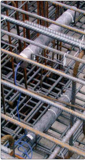
● Model 4370 installation.