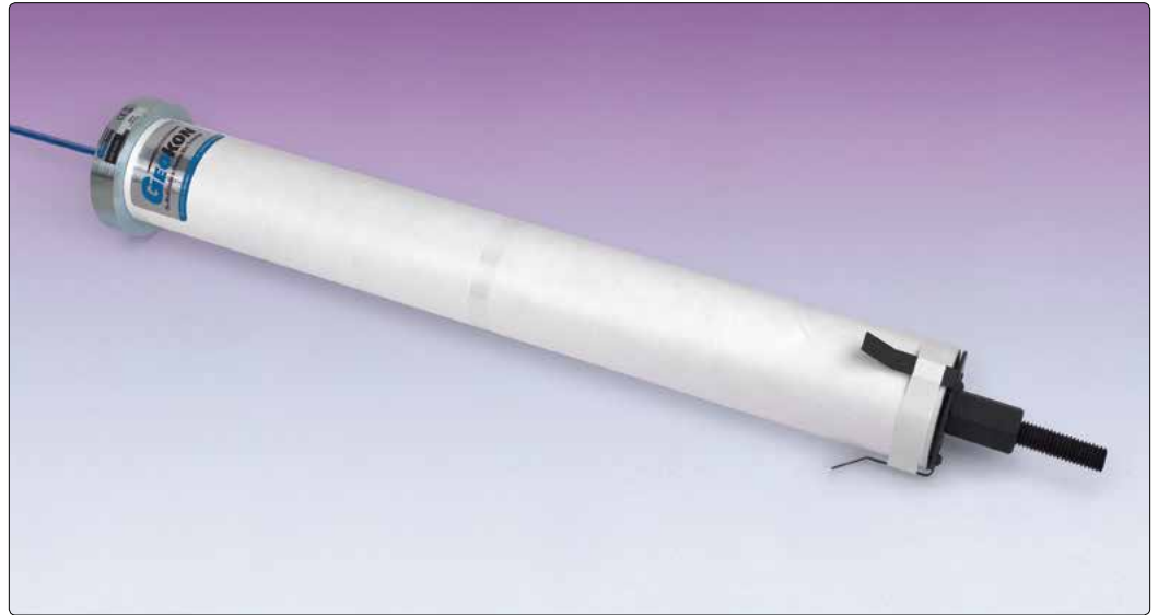
• Model 4370 Concrete Stressmeter.

The Model 4370 was developed in conjunction with the MPA Braunschweig, Germany.