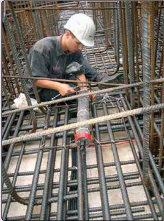
• Model 4370 installation.

The Model 4370 was developed in conjunction with the MPA Braunschweig, Germany.