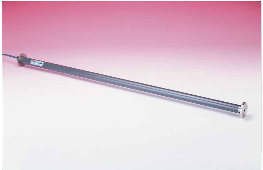
• Model 4430 Vibrating Wire Deformation Meter.