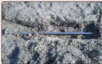
• Model 4430 Vibrating Wire Deformation Meter installation.