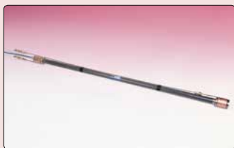
• Model 4430 Vibrating Wire Deformation Meter with hydraulic anchors.