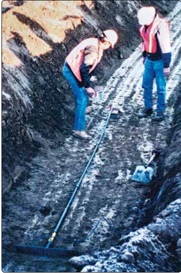
● Installation of Model 4435 sensors.