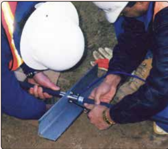
• Attaching the end flange.