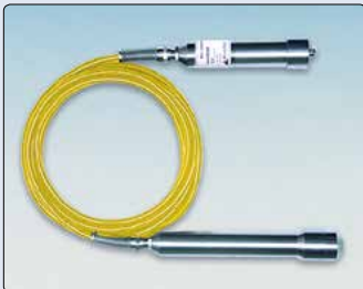
• The Model Level 2000 Water Level and Temperature Datalogger.