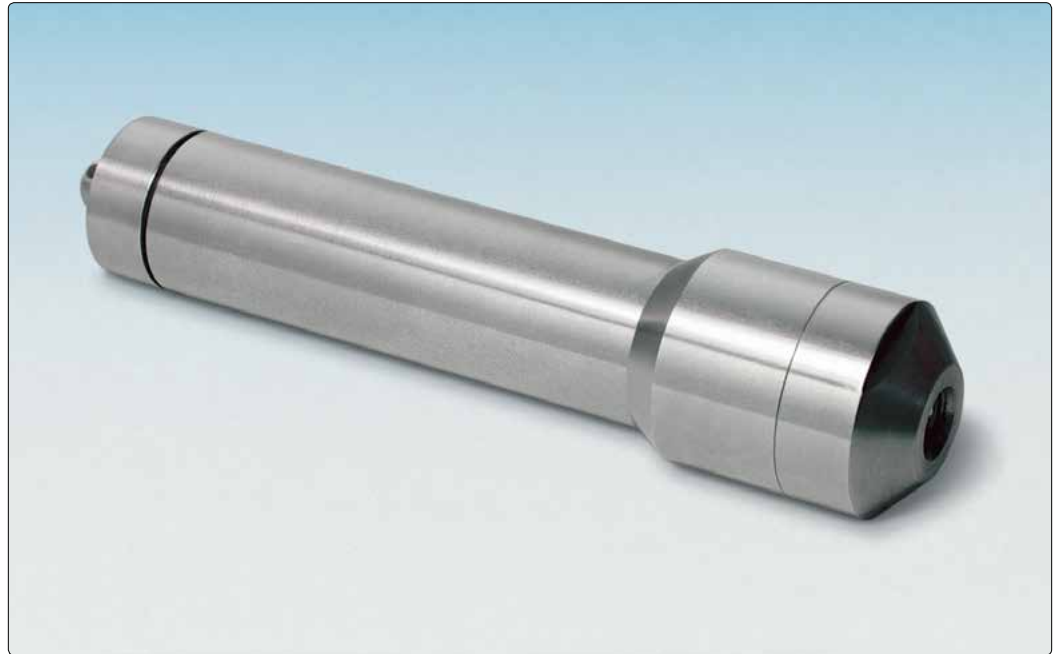
• The Level 1000 Water Level and Temperature Datalogger.