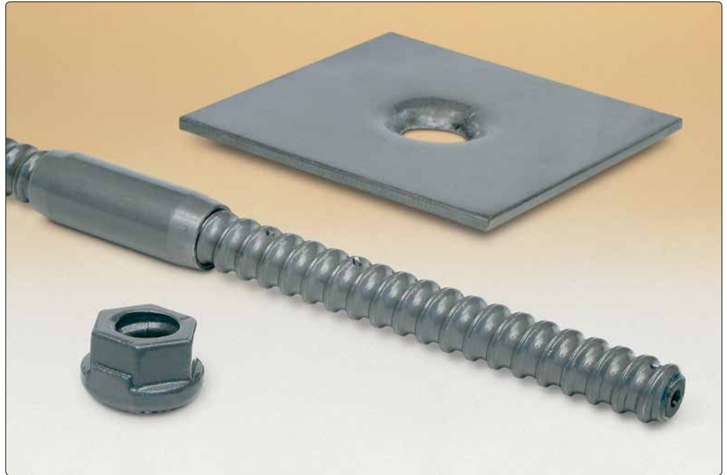
• Model 4910 Instrumented Rockbolt components (front to back: nut, rockbolt and mounting plate).