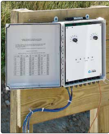
● Model 4999-16VTS