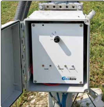
● Model 4999-11-4S