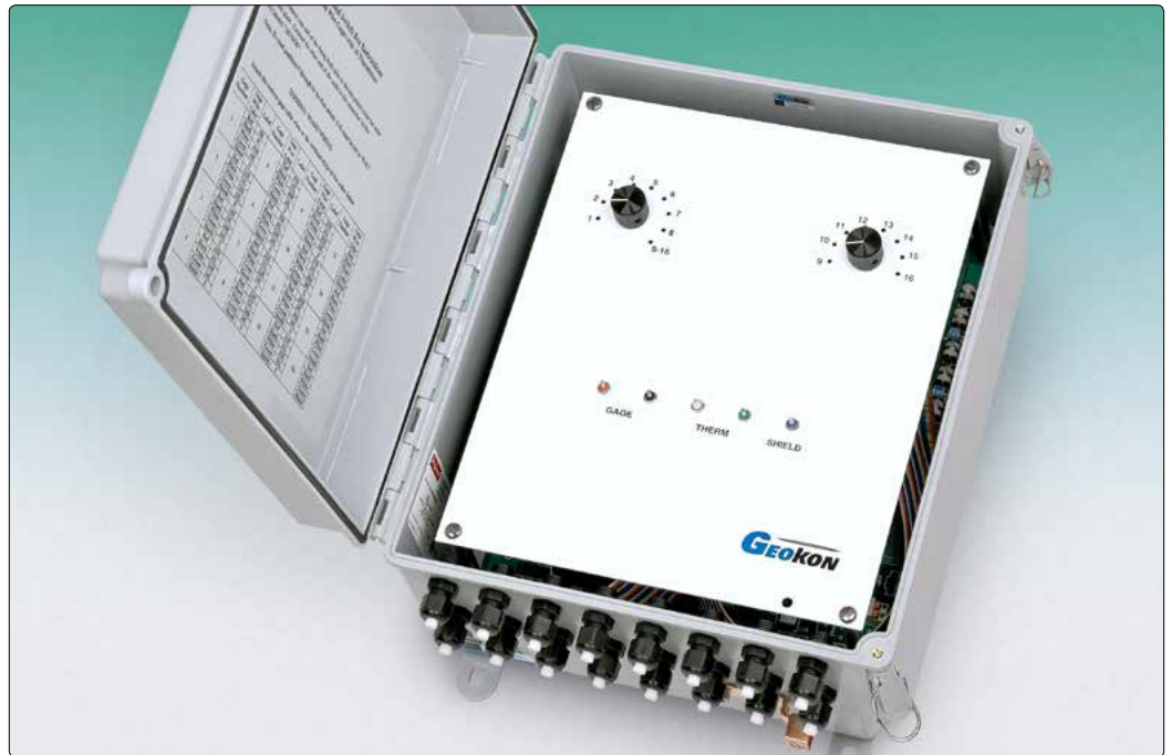
• Model 4999-16VTS Terminal Box.