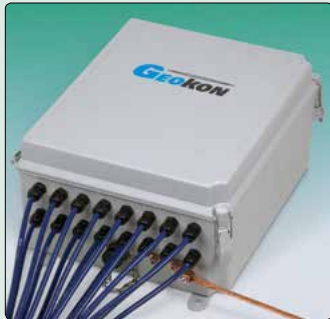
• Model 4999-16VTS Terminal Box.