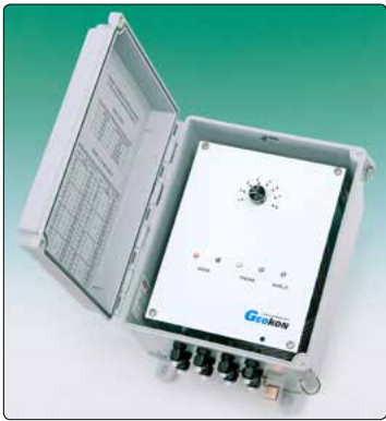
● Model 4999-11-8S