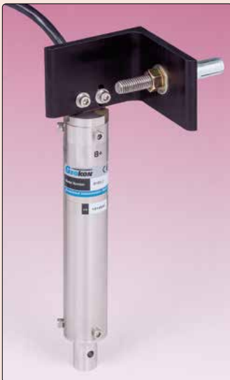
• Model 6160A-2 Biaxial MEMS Tilt Sensor with mounting bracket assembly.