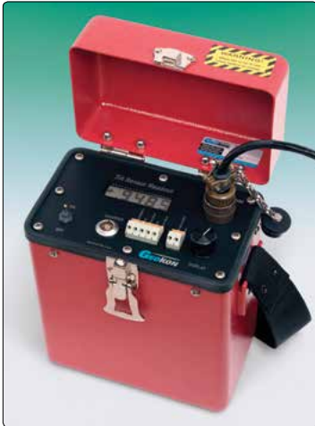
● The Model RB-500 MEMS Readout for use with the Model 6160 Tilt Sensors.