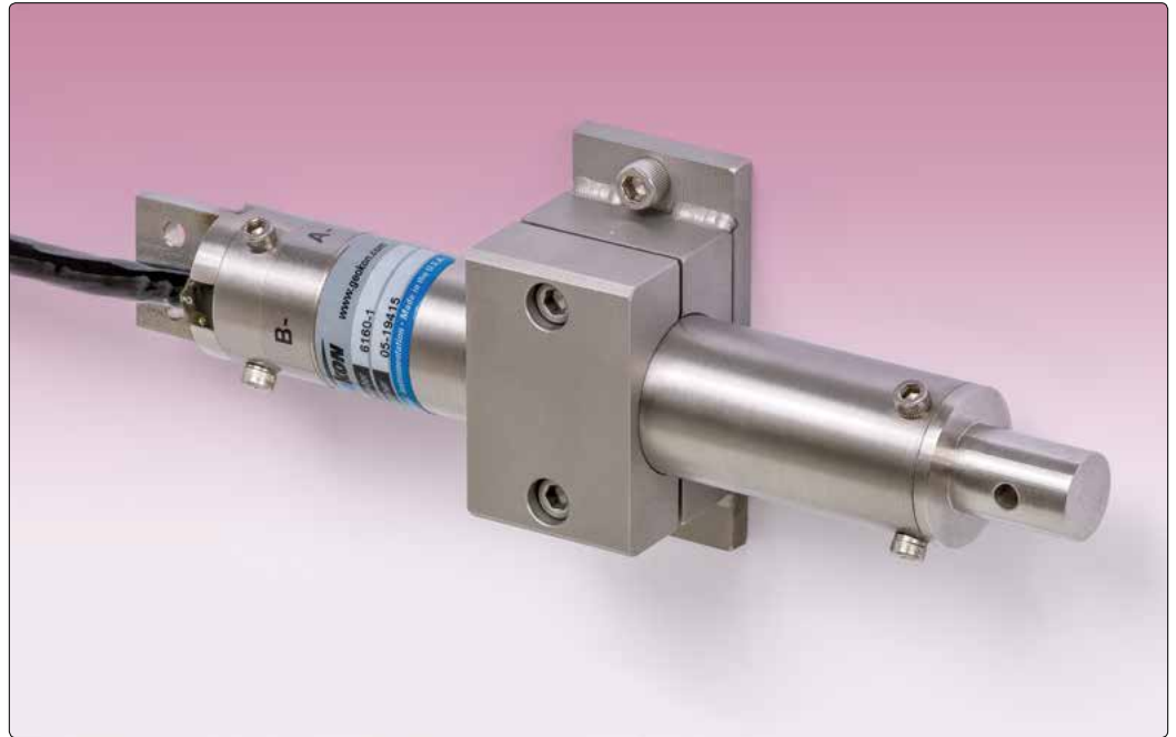
• Model 6160A-1 Uniaxial MEMS Tilt Sensor with horizontal mounting bracket assembly.