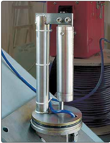
● Model 6350 installation using a custom mounting bracket designed for concrete face rock fill dam applications (shown with protective cover removed).