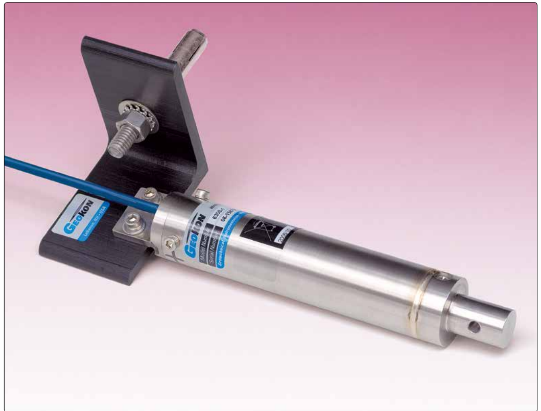
• Model 6350 Vibrating Wire Tiltmeter shown with mounting bracket assembly.