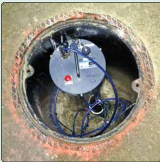
● Model 8040T configured to read a Model 4500 Vibrating Wire Piezometer.