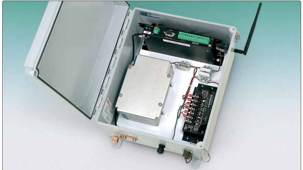
● Model 8040 2-Channel Wireless Vibrating Wire Interface Module.