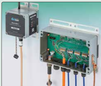
• Model 8800-1 Sensor Node (l) connected to the Model 8800-8-3 Multiplexer (r), shown with multi-pair cable entry configuration.