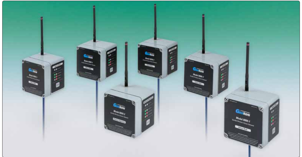
• Model 8800-2 Network Supervisor (center), surrounded by five Model 8800-1 Sensor Nodes.