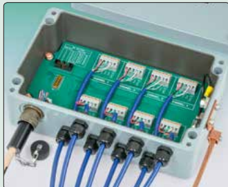
• Model 8800-8-1 Multiplexer, shown with eight 2-pair cable connections.