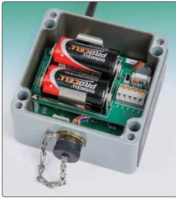
• Model 8800-1 Sensor Node, with 10-pin connector option and cover removed to show battery compartment.