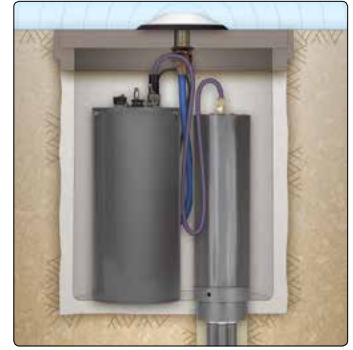
• Model 8026 Datalogger and Model 1280 (A-6) Extensometer in manhole.

Automatic monitoring is best accomplished using the Model 8021 or Model 8025 Dataloggers which can be configured to read at predetermined intervals, and to initiate alarms in the event threshold levels are exceeded. Alternatively, for extensometers installed in active roadways the Model 8026 Wireless Datalogger provides a convenient option.