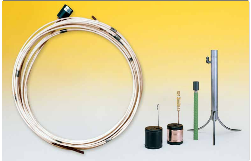
• Model A-6 assembled with groutable anchors and coiled for shipment. All anchor options shown right (left to right): Snap-Ring, Hydraulic, Groutable and Borros Type.