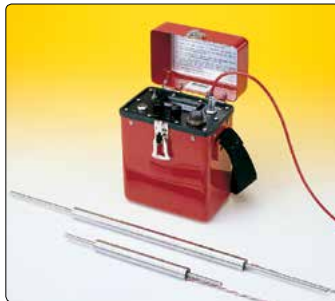
• Model 1500 Linear Potentiometer pictured with Model RB-100 Readout.

The Model 1500 utilizes a sturdy 6.5 mm diameter rod which protrudes from both ends as the actuating shaft. This facilitates connection of the linear potentiometer to extensometer rods and also permits a mechanical check on the readings using either a dial indicator or a depth micrometer.