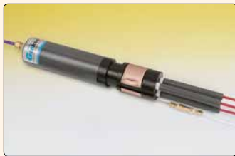
• Model A-6 Flexible Rod Extensometer, with flangeless type head assembly.