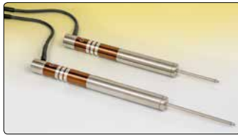
• Model 1450 DC-DC LVDT

DC-DC LVDT's for dynamic and/or high temperature applications are also available. Standard ranges are 50 mm, 100 mm and 150 mm. Other ranges available on request.