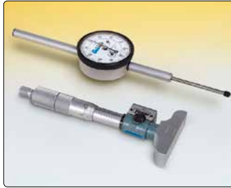
• Model 1400-1 Dial Indicator (top) and Model 1400-4 Digital Depth Micrometer.

Electronic readout is achieved using Model GK-404 or GK-405 Vibrating Wire Readouts (Model 4450) or the Model RB-100 Linear Potentiometer Readout (Model 1500). (See below).