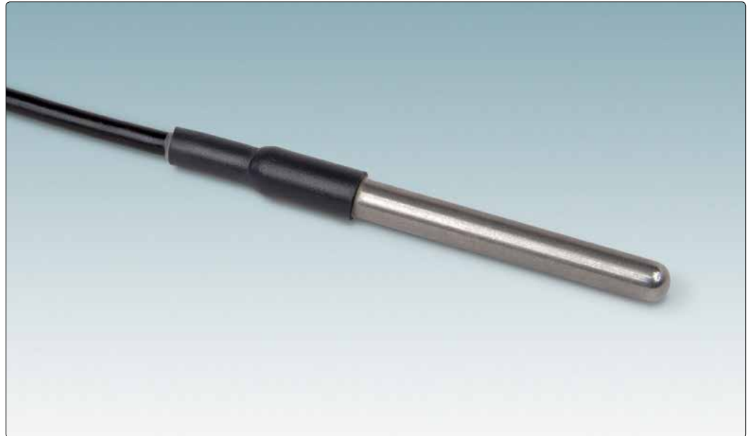
• Model FP4700 Fiber Optic Temperature Sensor.